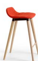
BOP WOOD Chair & Bar stool By Knudsen Berg Hindenes