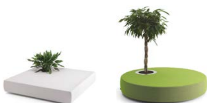
GREEN ISLANDS Ottoman By Jean-Marie Massaud