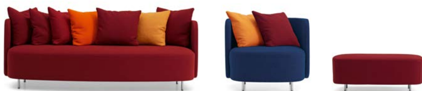
MINIMA Sofa, Easy Chair & Ottoman By Claesson Koivisto Rune